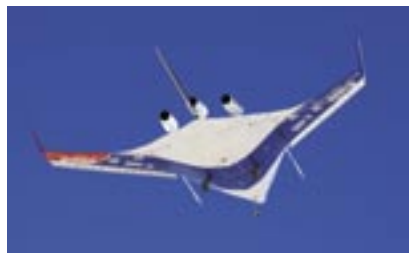
X-48B BLENDED WING Flying wing/conventional plane hybrid