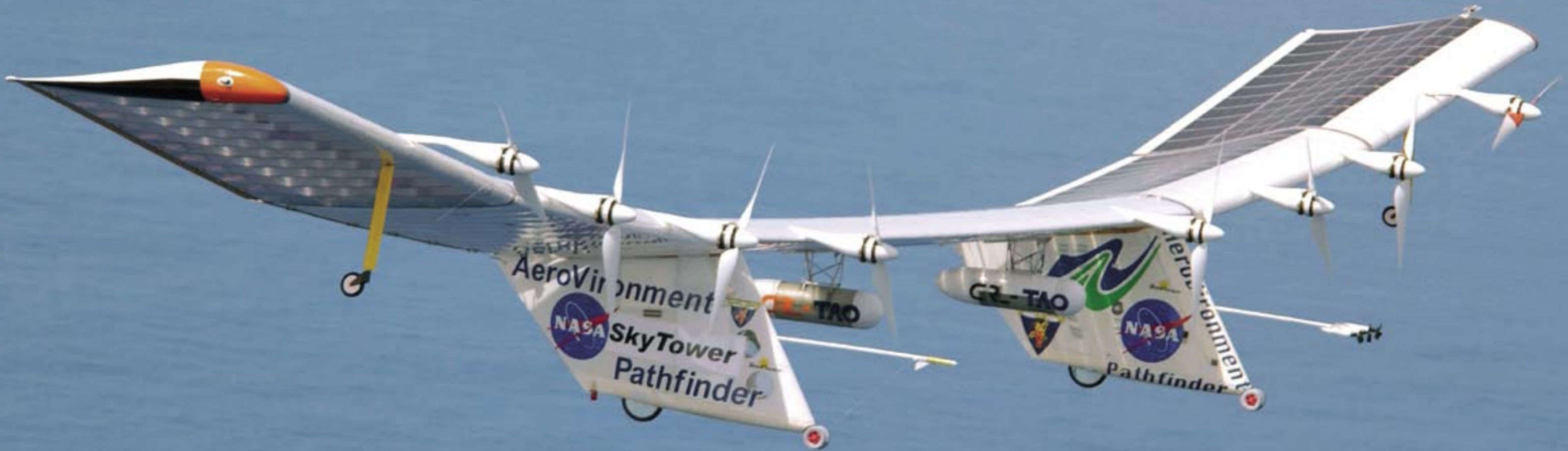
NASA's Helios Prototype solar-electric flying wing. Prior to its loss in an 'in-flight mishap', the Helios Prototype set a world altitude record for propeller-driven aircraft of almost 97,000 feet (29,566 metres)