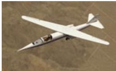
OBLIQUE WING Wing could be rotated for maximum efficiency

For 60 years, NASA has been carrying out aeronautical research at its Dryden Flight Research Center at Edwards, California. Here are just a few of the radical designs that have flown in the clear skies above the Mojave Desert