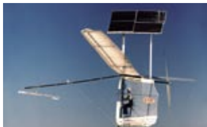
GOSSAMER ALBATROSS II Used for slow-speed flight tests