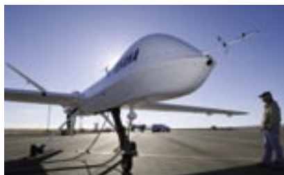
IKHANA Airborne platform for testing new technologies