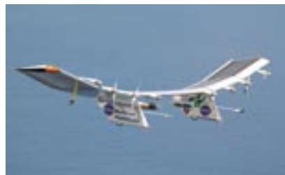
HELIOS Prototype solar-electric flying wing

says that it can deliver its first SkyCat hybrid air vehicle within 36 hours of a confirmed order.